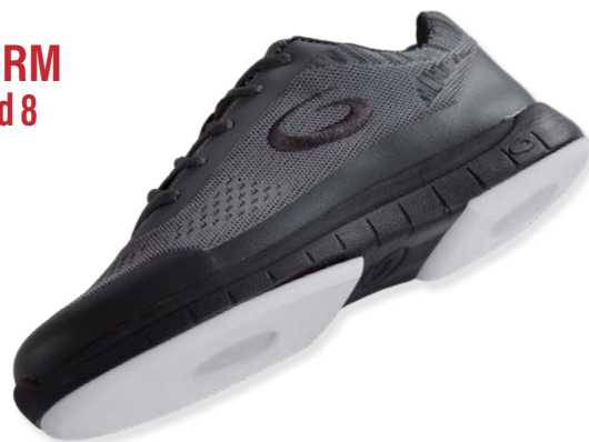
STORM Speed 8