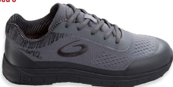
CHINOOK Speed 5