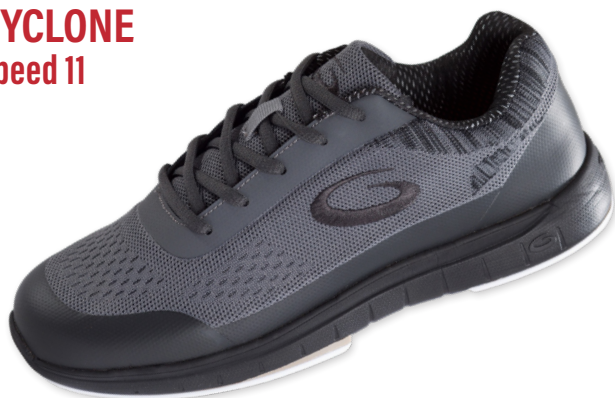
CYCLONE Speed 11